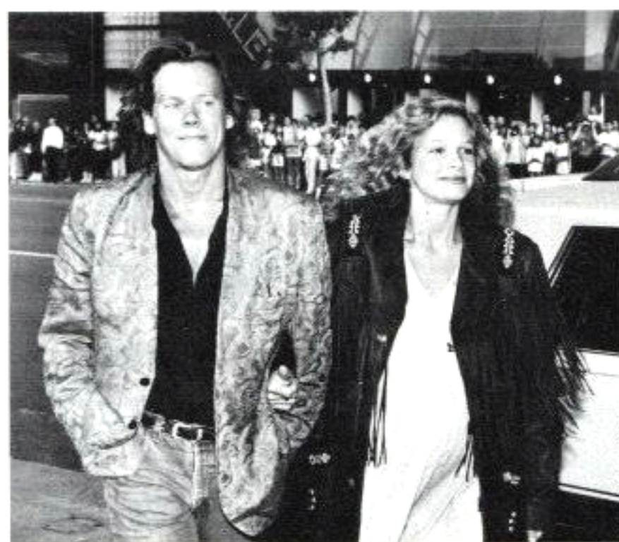
Kevin Bacon and Kyra Sedgwick stayed calm, though their baby's due date was only days away.