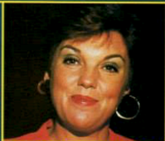
Tyne Daly: After Cagney & Lacey , taking the stage with Gypsy