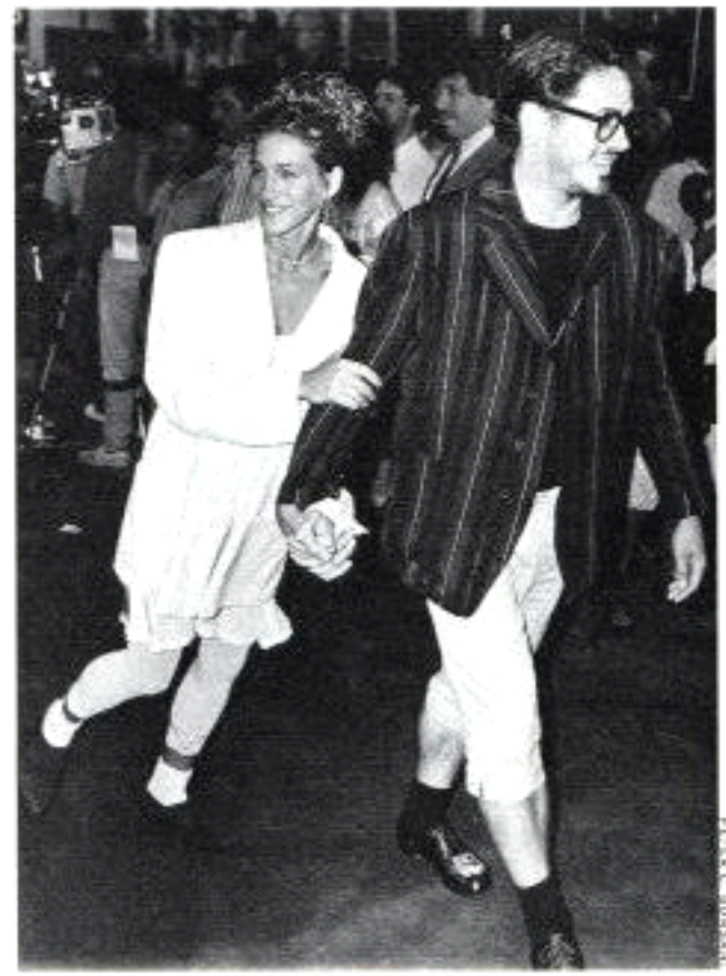
Fashion-busting chums Robert Downey Jr. and Sarah Jessica Parker haunted each other all evening.