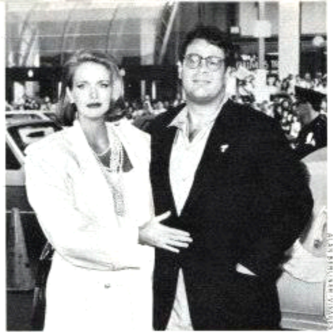
"We wanted it to be both funny and scary," said Dan Aykroyd, with wife Donna Dixon.